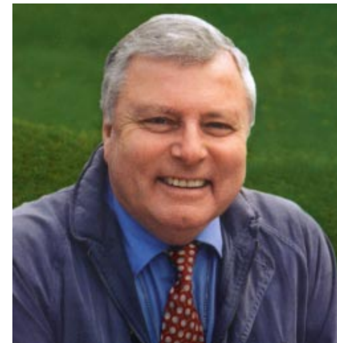
JBGS Honorary Vice President Peter Alliss